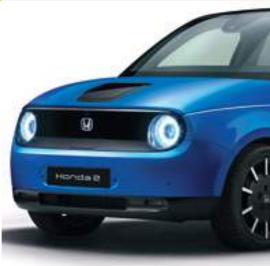
PREMIUM CRYSTAL BLUE METALLIC